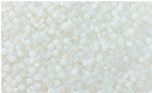
BAMClean 1 is a fully refined paraffin wax and is supplied in pastilles.