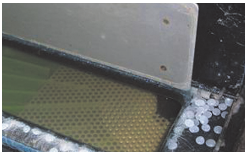
After over a year's continuous production, the tank has remained clean and clear - with no danger of nozzle blockages.

The photograph left shows a hot melt tank in a poor state – the result of a standard packaging hot melt being allowed to degrade. Not only does it look awful, but it will lead directly to nozzle blockages, production stoppages and increased costs.